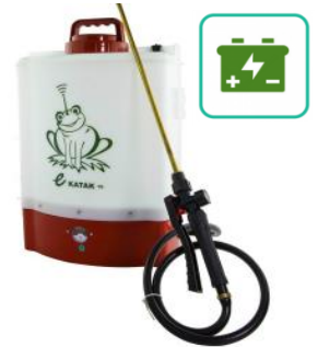
Knapsack Sprayer (Battery)