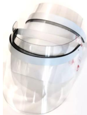
Acrylic or PVC Face Shield