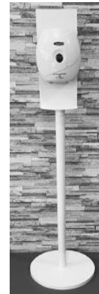
Automatic Sanitizer Dispenser