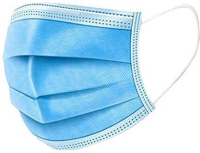
3-ply & 4-ply Face Mask