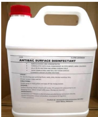
PCMX & Surface Disinfectant